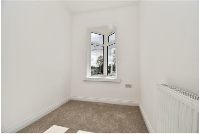
Bedroom three 7'3" x 5'10" (2.22 x 1.80 )

UPVC double glazed pique window, central heating radiator, and carpeted flooring.